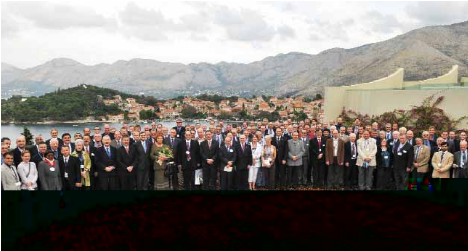
Conference delegates with the town of Cavtat in the background.