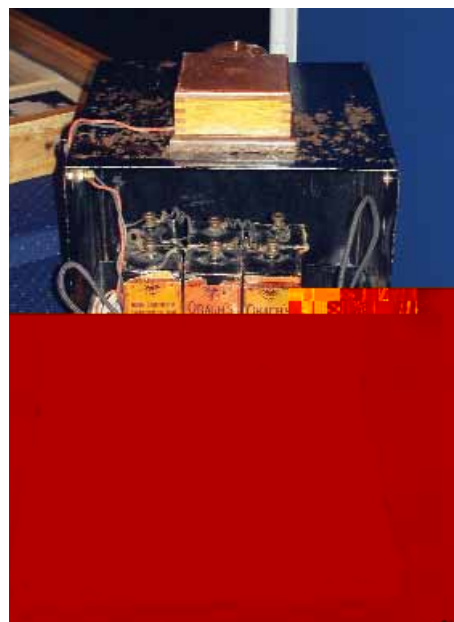
The original portable coherer receiver used by Marconi to demonstrate his invention to the public at the Toynbee Hall, London, 12 December 1896.

See www.bodley.ox.ac.uk/dept/scwmss/wmss/online/modern/marconi/marconi.html .