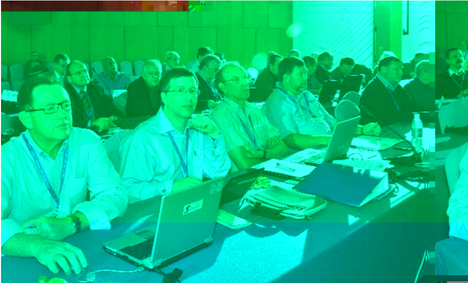
RSGB team at the Final Plenary meeting.