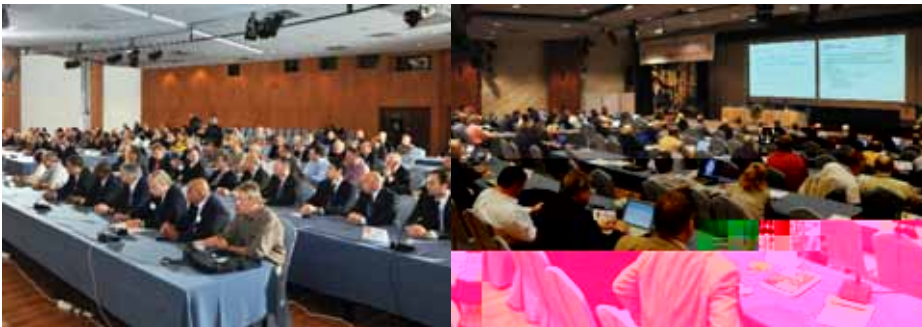
The Opening Plenary meeting.

C4 HF. This report was prepared by John Gould, G3WKL, RSGB HF Manager. The key HF focus was the expanded 40m band, which comes into play when the broadcasters move out of 7.1 – 7.2MHz from 29 March 2009. Inevitably, there were widely differing views but all agreed that CW, digimodes and SSB should get additional spectrum. The new 40m bandplan includes provision for digital voice and also recommends 'contest preferred segments' for both CW and SSB.