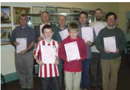
The recent group of successful candidates, including the three staff from the Allerdale Council Emergency Planning Department.

Previously ten of the Cumbria County Council emergency planning officers have gained their Foundation Licences and the club have since been asked to provide a further specific course for between 6 - 10 others.