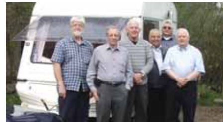
Operators GM3TCW, GM4LQR, GM4UBJ, GM8JYJ, GM8FHK and GMOSYV.

Although no real attempt was made to operate the station 'competitively', operating from this remarkably 'low noise' site yielded 160 contacts over the weekend. Conditions in general were pretty flat over most bands when the station was active but 110 contacts were made on 80m; 40 on 40m; only 6 on 20m and 4 on 17m – an unexpected bonus! Overall, 14 countries were logged, the best DX being Israel and European Russia. A total of 18 other mills participating in the event were contacted including one in Holland, several windmills and the only other Scottish Mill activated, at Benholm near Johnshaven in Aberdeenshire by the Aberdeen Club.