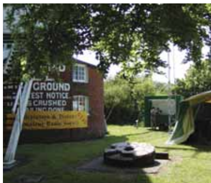
General view of the Braintree Club's set-up.

Over the weekend, 108 HF contacts and 47 VHF contacts were made and they worked 29 mills on HF, 8 on VHF and one mill via D-Star. This list of contacts would, they report, have been higher had the weather not been so nice – at such a lovely and picturesque site it was nice just to site outside in the sun and enjoy the location.