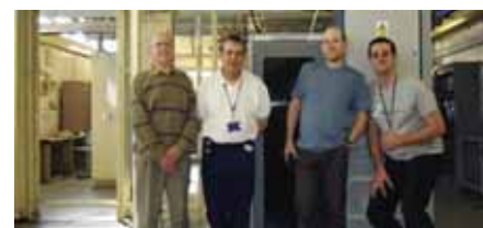
The SARG Committee

Until now there has been a coverage hole along the A14 in Suffolk from south of Stowmarket to Newmarket. The South Anglia Repeater Group have now put GB3EA on the air from Wickhambrook (between Bury St Edmunds and Haverhill). Initial reports of coverage have been encouraging with good signals reported across East Anglia. You can log reports by visiting the repeater blog at http://gb3ea.blogspot.com . The repeater output is on 145.6875MHz with CTCSS-only access at 110.9Hz.