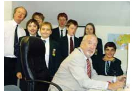
Silcoates School ARC.

The young operators at Silcoates School ARC